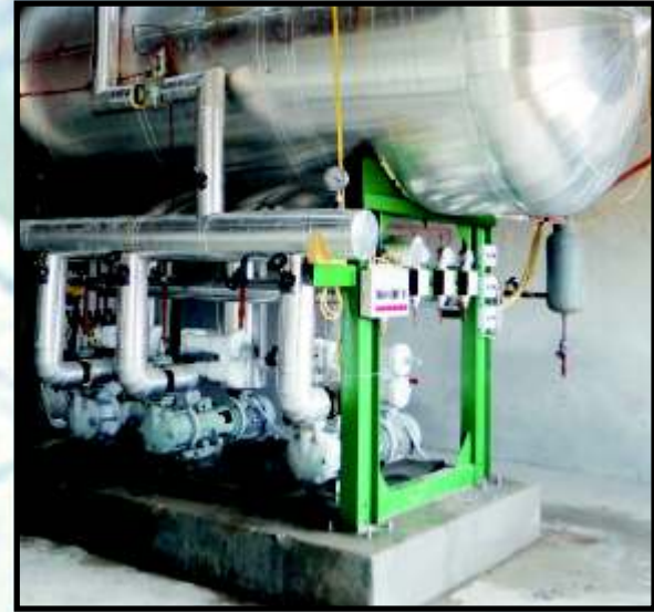
Plant room view of liquid overfeed system with liquid ammonia pump and low pressure liquid ammonia receiver.

Because of ideal entering suction gas conditions, compressors last longer. There is less maintenance and fewer breakdowns . The oil circulation rate to the evaporators is reduced as a result of the low compressor discharge superheat.