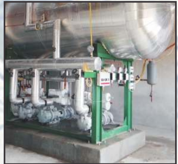
Plant room view of liquid overfeed system with liquid ammonia pump and low pressure liquid ammonia receiver.

Because of ideal entering suction gas conditions, compressors last longer. There is less maintenance and fewer breakdowns . The oil circulation rate to the evaporators is reduced as a result of the low compressor discharge superheat.