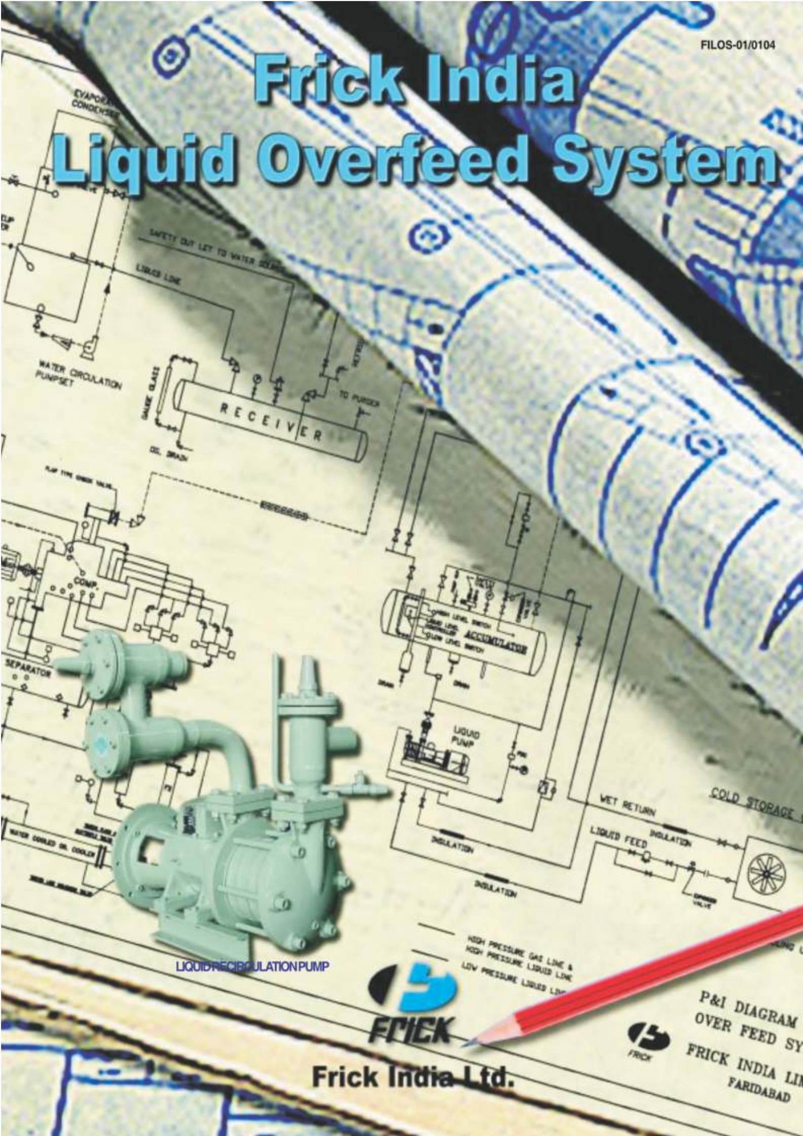
LIQUID RECIRCULATION PUMP